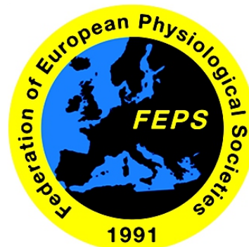
European Federation of Physiological Societies (France)